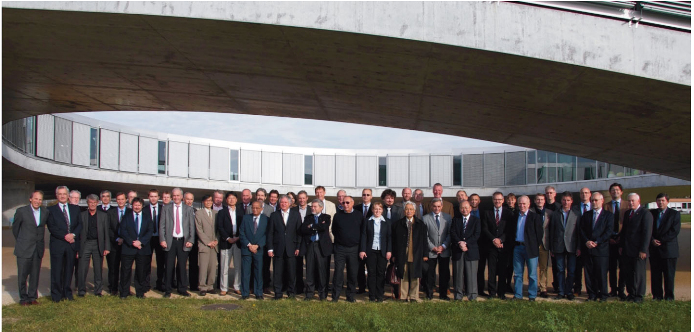
Members of the 11th fib General Assembly, who approved the Model Code 2010 by unanimous vote.

On 29 October 2011, the 11th General Assembly of fib convened in Lausanne, Switzerland and accepted the fib Model Code 2010 (“MC2010”). Publication is planned for 2012, following a final editorial review by a small Editorial Group to be chaired by Joost Walraven , to achieve consistency and correctness throughout the entire document.