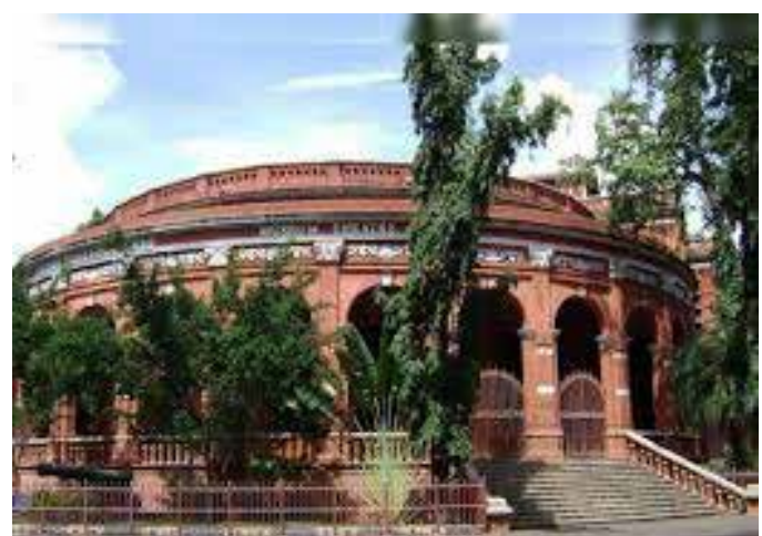
Rani Durgawati Museum