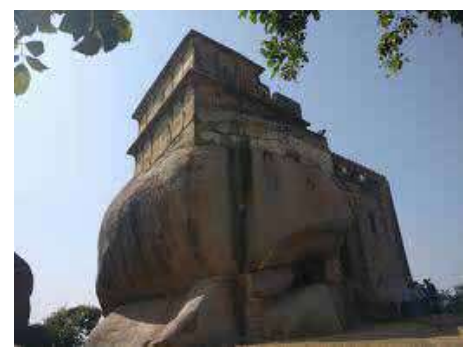
Madan Mahal Fort